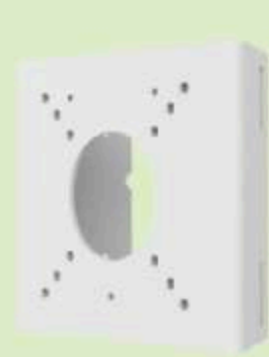
U1-ACC-B-POLE06-B Bullet Pole Mount Adapter