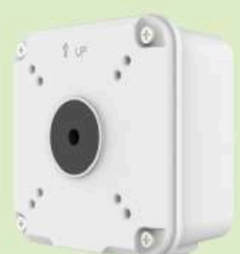
U2-ACC-BC-JB06-A-IN Middle Bullet Junction Box