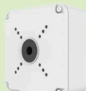
U2-ACC-B-JB07-D-IN-V2 Bullet Junction Box