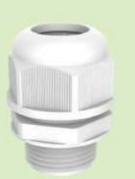
U1-ACC-B/D/H/T-ADP01 Plastic Waterproof Joint