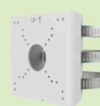
U2-ACC-B/D/T-POLE06-C-IN-V2 Pole Mount Adapter