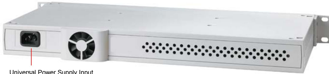
Universal Power Supply Input