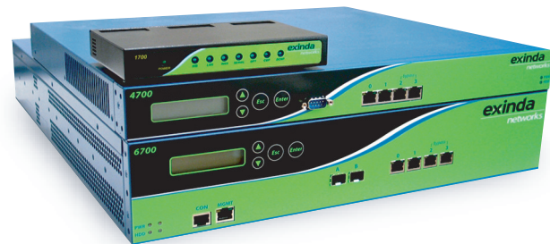
Exinda x700 Traffic Management products